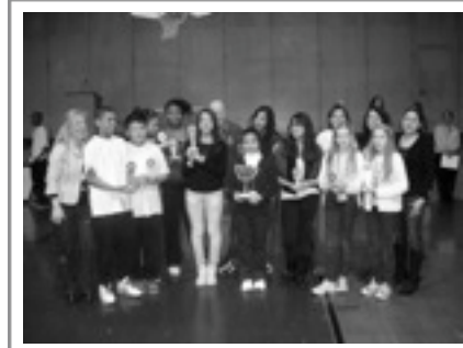
The 2011 Science Fair winners!